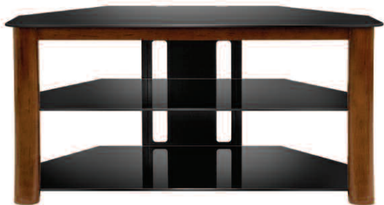
TV Shown Mounted on Wall Mount